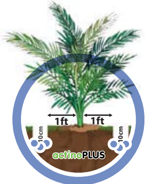
Immature Palm (≤6 Years) 300g per palm