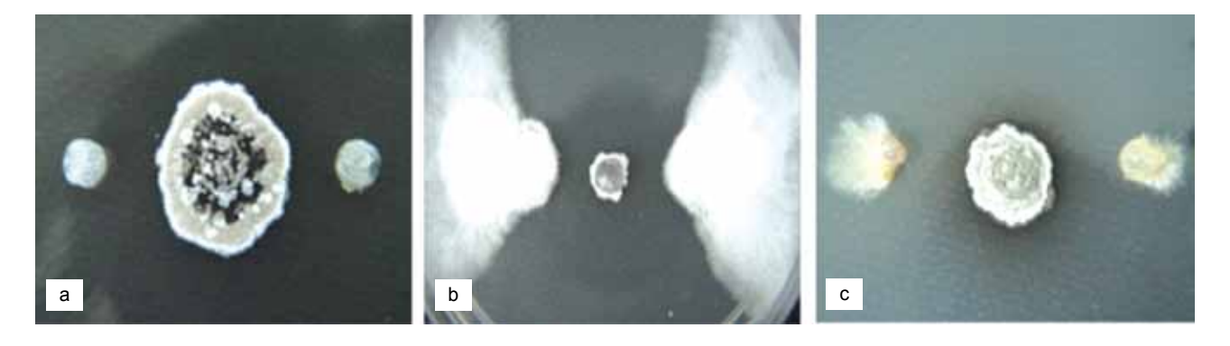
Figure 3. Three growth pattern of G. boninense observed on in vitro plates from 21 potential isolates with highly antagonistic effect towards G. boninense. a ) No formation of new mycelia from the G. boninense plug on both sides; b ) new mycelia generated from the added G. boninense plug with high inhibition on area facing actinomycetes and, c ) very little formation and sparse growth of new G. boninense mycelia generated from the plug.

3). Plates containing only G. boninense plug from the same source without any biological control agent showed a normal growth with the appearance of white cottony mycelia growth. Although 61.8% of the actinomycetes isolates did not show any antagonistic activity against G. boninense in this study, they may produce other useful compounds.