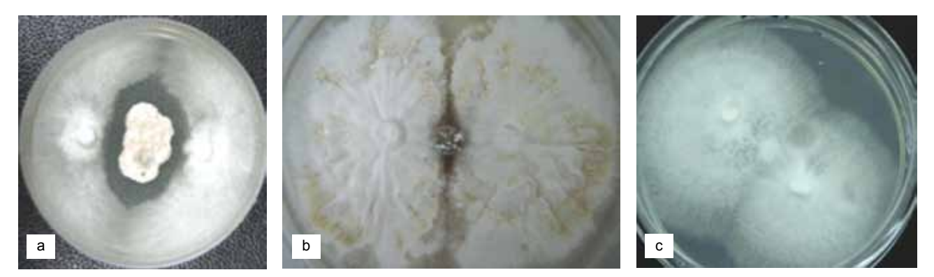
Figure 2. In vitro assay plates of actinomycetes isolates against G. boninense; a) clear distance observed between tested actinomycetes and G. boninense, b) contact inhibition between tested actinomycetes and G. boninense and c) no inhibition between tested actinomycetes and G. boninense.